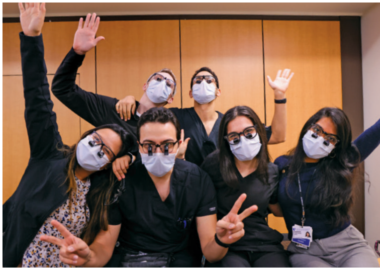
Each ophthalmology resident received a set of surgical loupes thanks to an alumni gift.